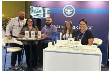
ITF at exhibition booth at FTE 2023.