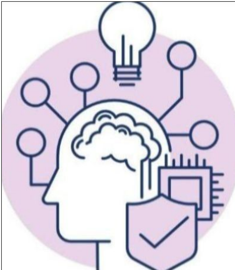
IDEA Targeted BAA 2019 closed on January 17, 2020