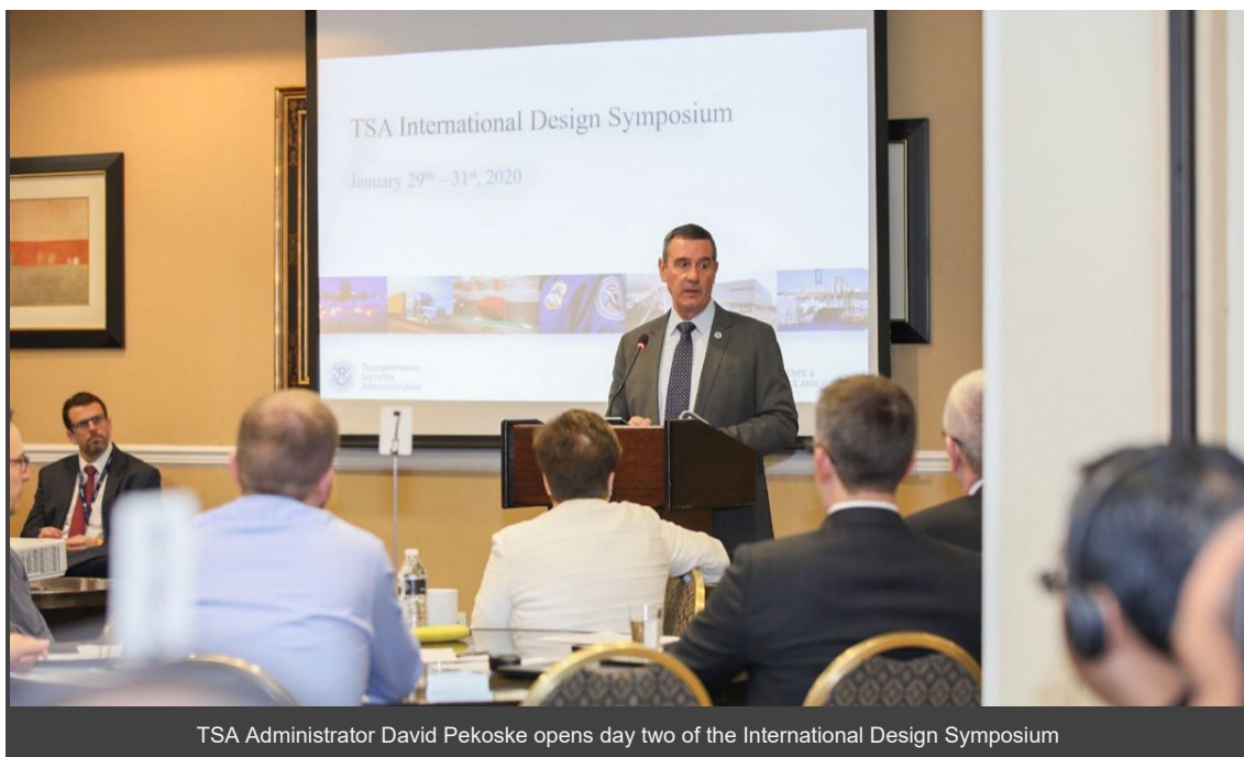
TSA Administrator David Pekoske opens day two of the International Design Symposium